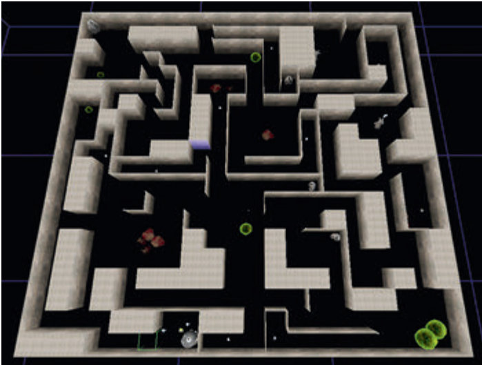
Mount Sinai researchers used this computer-generated 3D spatial maze to explore the impact that removing a CPAP mask during REM sleep has on the wearer's mental performance.